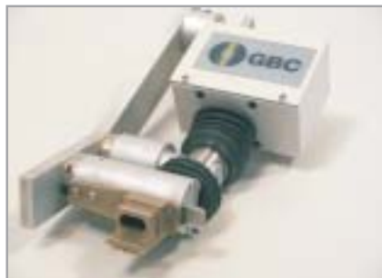
Upgrade graphite monochromator and detector

100% efficiency is provided for \text{CuK}\alpha and \text{CoK}\alpha together with maximum count rates comparable to scintillation detectors and with better signal/noise ratio. The cost effective curved graphite monochromator is available for \text{Cu/Co} or for \text{Mo/Ag} wavelengths. Fittings are available for most popular goniometers and shielding.