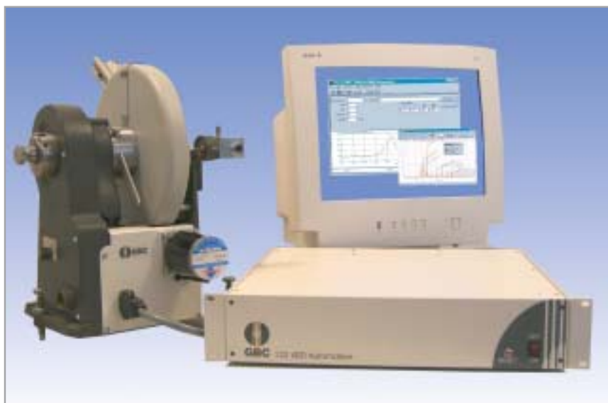
122D Upgrade added to Philips PW 1050 goniometer