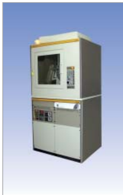
122D Upgrade fitted to Siemens D500 Diffractometer

TRACES is designed to work with "real-world" data and includes more than 100 functions which range from background stripping and pattern generation to Search/Match. A policy of "Open Access" means that all data is stored in ASCII files. This means data can be readily investigated and adapted to and from other XRD data analysis software, including some excellent public domain programs. In addition, TRACES provides close integration with ICDD PDF-1, PDF-2 and PDF-4 data bases.